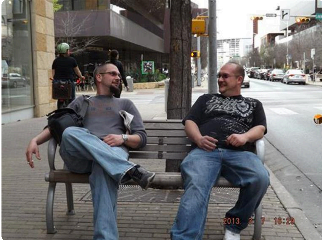
Our two boys in a recent picture from Austin, TX